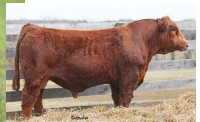
WHF Limitless B011 - Service Sire