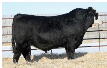
Double Bar D Bankroll 804F - Service Sire and Sire of multiple lots in our offering