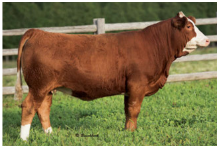
Full Sister to Lot 1, sold in the OASC 2020 sale to Bar 5