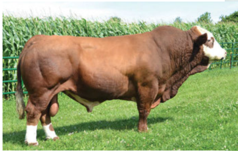
LRX HP Rocket 23Y - Service Sire