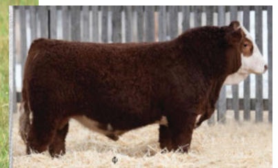
Ultra/CD Legend 401F - Service Sire