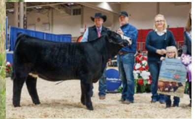
RPCC BLK Elsa 234E - Dam