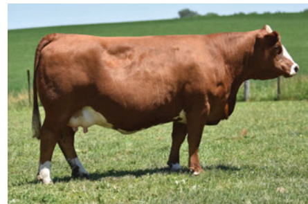
Maternal sister sold to Mark Land & Cattle