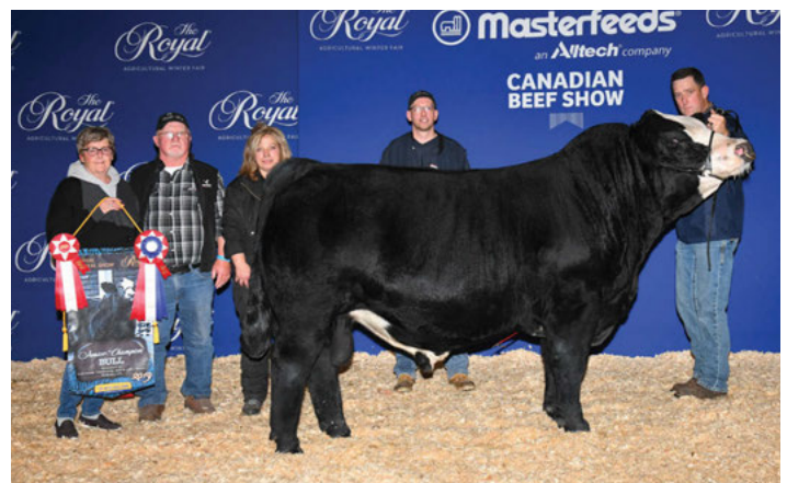
Maple Key Black Powder - Sire