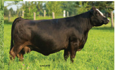
Double Bar D Fiesta 436C - Dam