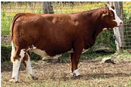
Maternal sister sold to Leahy Livestock