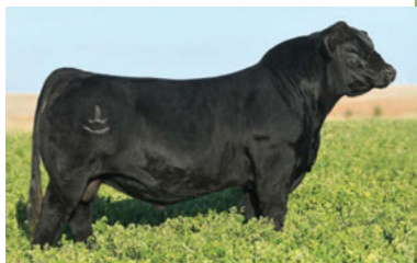
KCCI Exclusive 116E - Service Sire

47 LHF HONKY TONK GIRL 130H Purebred Female Polled BW: 86 BPG1309867 LHF 130H 30/01/20 LFE GOTHAM 819Y LFE BS CHARO 23Y LFEBSI BLACKADVANCE 426U LFE BS MISS LEWIS 614S MR HOC BROKER IRCC XCELLA 2X IRCC AUTHENTIC 317A IRCC U GO GIRL 804U LFE THE RIDDLER 323B LHF RIDDLE ME THIS 24F LFE HEAVEN SENT 30X IRCC BOOMSHAKALAKA 434B LOCUSTHILL BOOM GIRL IRCC CUTE GIRL 547C CE: 7.0 BW: 5.5 WW: 91.9 YW: 139.5 Milk: 27.0 MCE: 5.2 MWW: 73.0